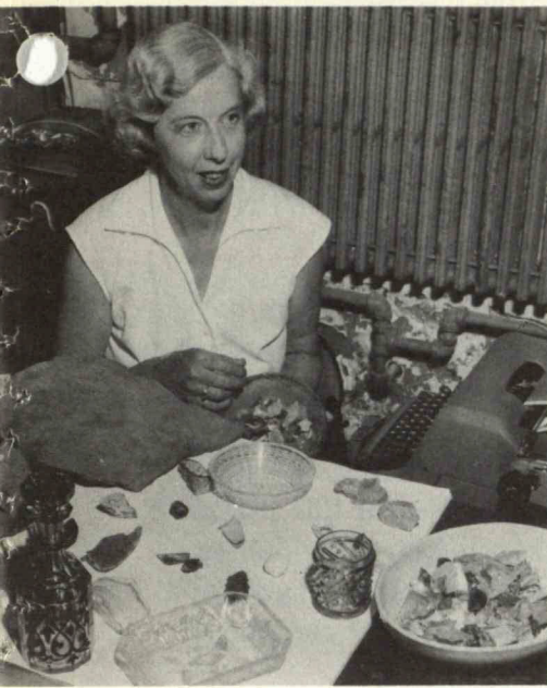
Sandwich specials: dug and purchased

certain antique shops in the area, and in the corridor of Bldg.