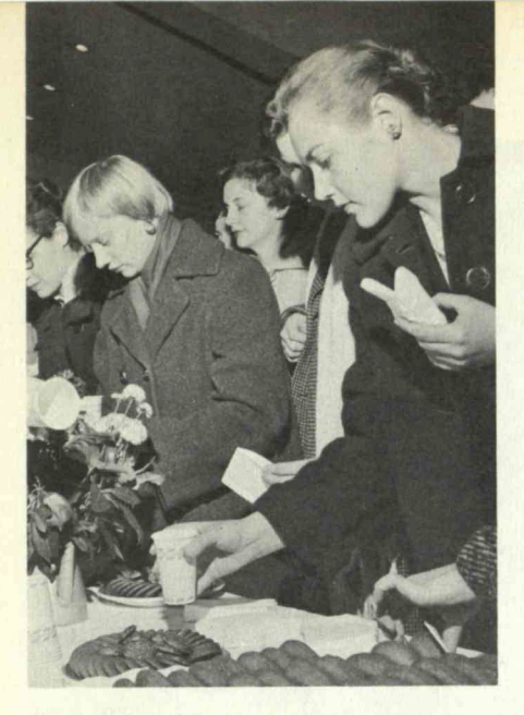
Should auld acquaintance...