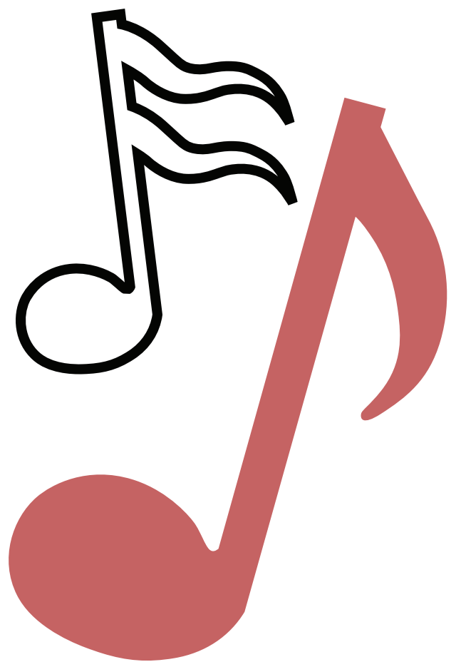
The MIT concert choir