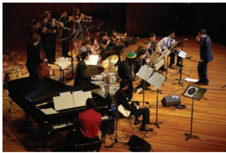
Some of MIT's music ensembles include, clockwise from top left, Rambax MIT, MIT Chamber Music Society, MIT Festival Jazz Ensemble, Gamelan Galak Tika. Institute Professor John Harbison is shown in the top middle.